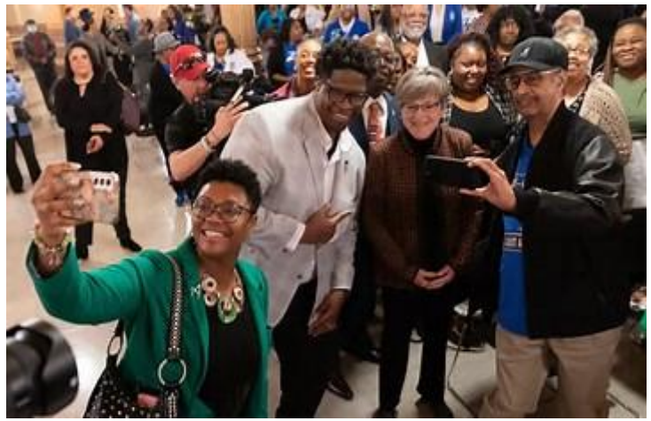
Gov. Laura Kelly poses for photos after signing a proclamation designating Black History Month for the state during a ceremony at the Statehouse Monday, Feb. 19, 2024.